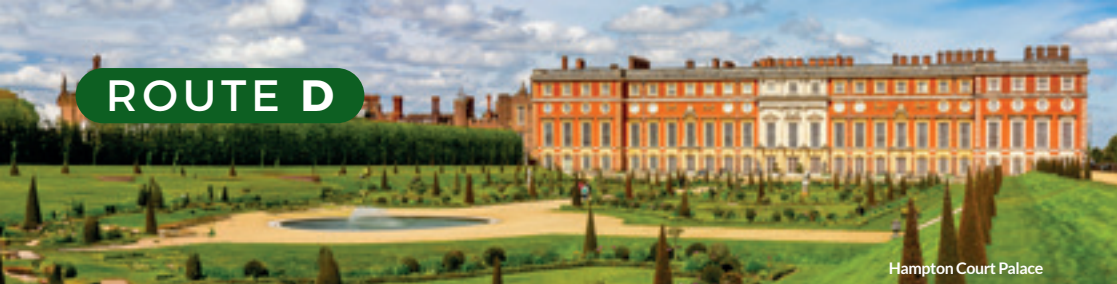
Hampton Court Palace