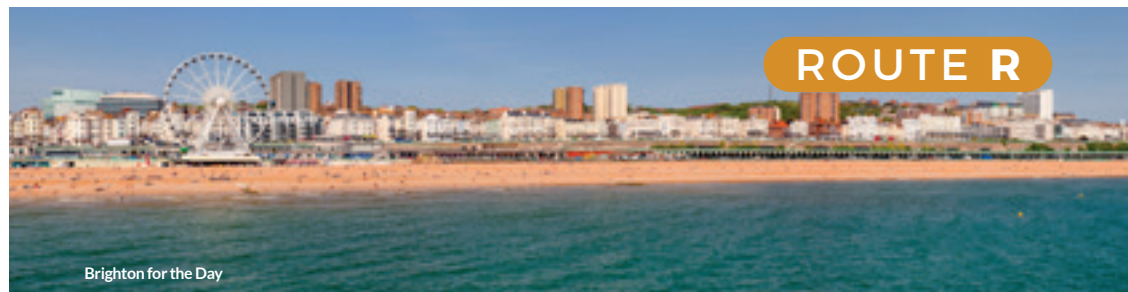
Brighton for the Day