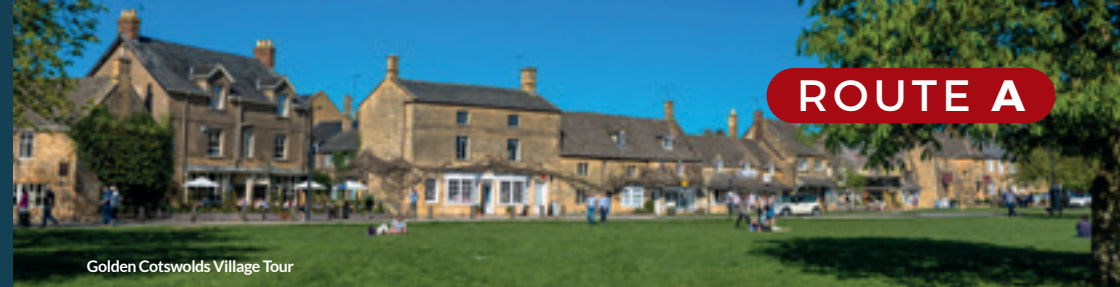
Golden Cotswolds Village Tour