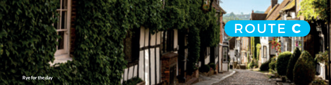
Rye for the day